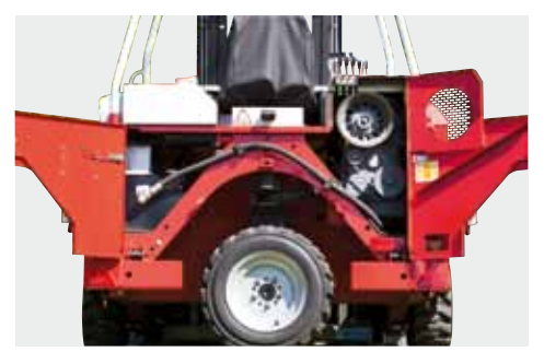
EASY AND TIME-SAVING MAINTENANCE

Clearly laid-out and easily accessible inspection and maintenance points