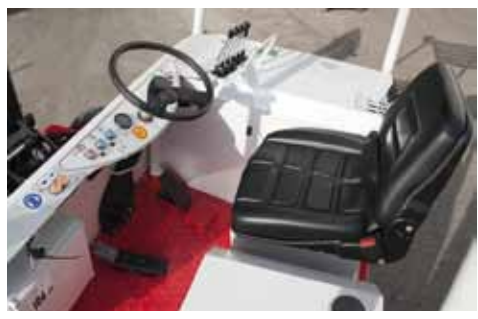
SAFETY AND COMFORT