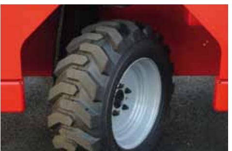
MAXIMUM MANOEUVRABILITY AND LONG SERVICE LIFE

Clearly laid-out and easily accessible inspection and maintenance points