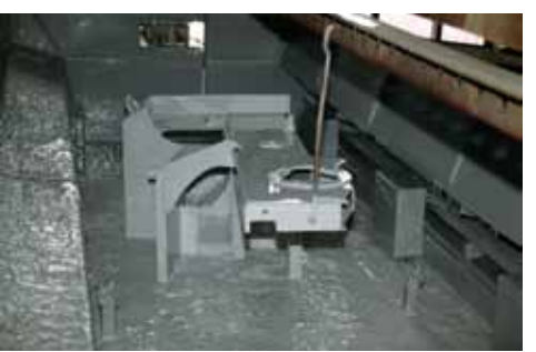
LONG-TERM VALUE RETENTION THANKS TO EASY THE BEST-POSSIBLE CORROSION PROTECTION SIDE