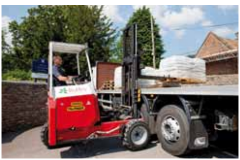
EASY LOADING AND UNLOADING FROM ONE SIDE