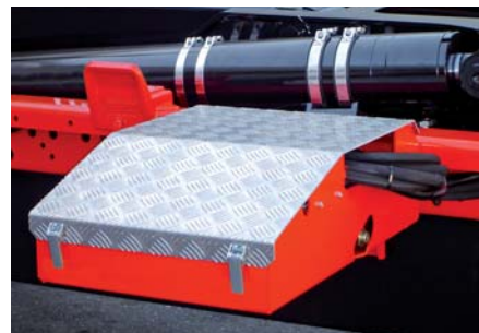
Protected hydraulic main valve