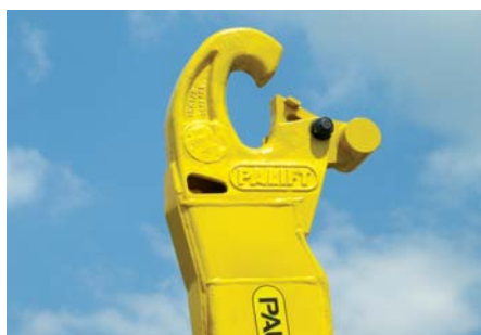
Cast steel hook for long lifetime