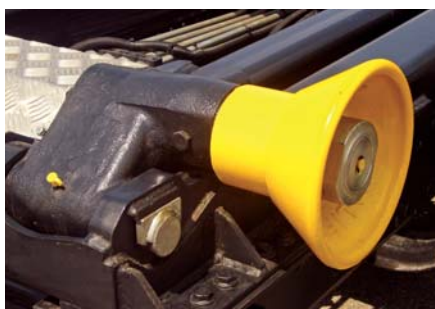
Cast steel rear roller for long lifetime