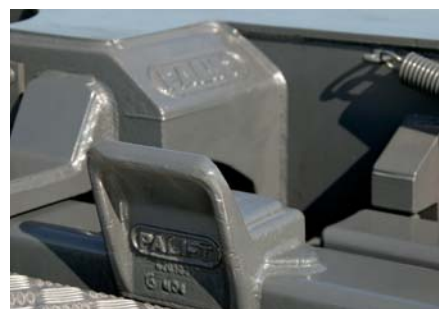
Cast steel container support for long lifetime