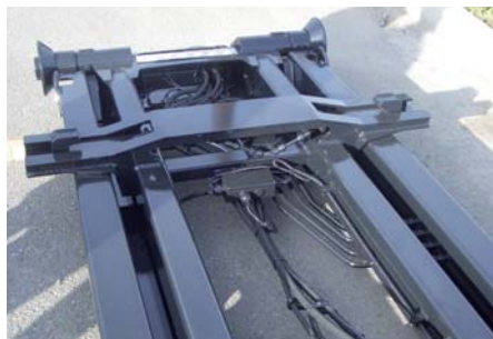
Hydraulic container locking