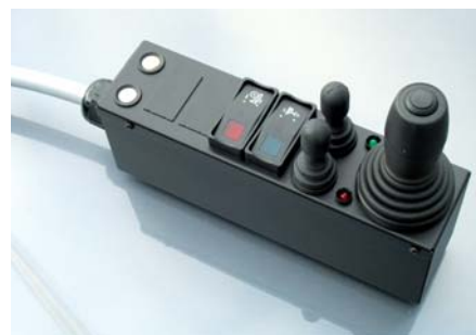
Ergonomic cab control