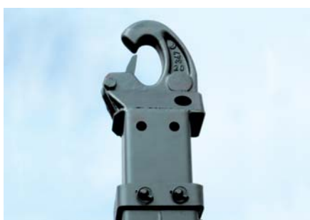
Mechanically adjustable hook height