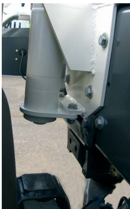
Boggy block cylinders